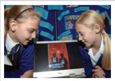
Year 5 children from Gwladys Street show guests examples of their professional photography and transition DVD.