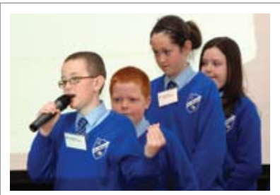
Year 5 children from St Monica's Catholic Primary School share a poem entitled 'When I Grow Up...'