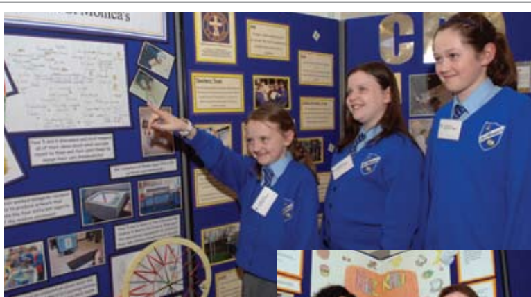
St Monica's Catholic Primary School display their enterprising work...