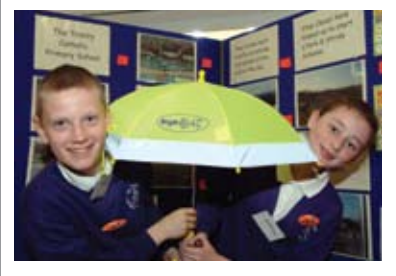
Year 6 Children from The Trinity Catholic Primary School showcase the Park & Stride scheme they are currently starting up.