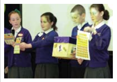
During the morning The Trinity Catholic Primary School shared their Stepclever experience with the audience and demonstrated how they reward and recognise enterprise at their school.